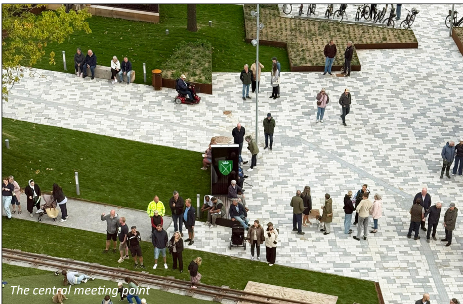
The central meeting point

Green elements in the form of grass and varied plantation helps to break the experience of a 'heavy' urban environment.