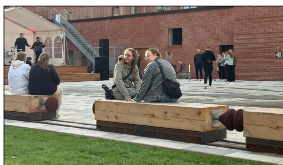
Moveable sitting space by the event area creates a reference to the area's earlier function as a railway station.