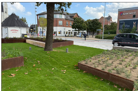
Green areas made with corten steel beds.