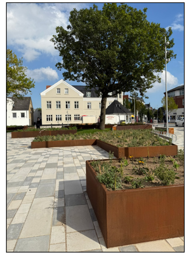
Corten steel plant bed and the square's tiling