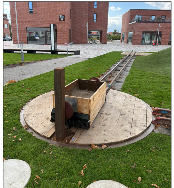
Sandbox wagon on rails that can drive between two sandboxes. A turntable between two tracks. Petanque court is shown on the left.